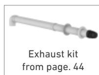
Exhaust kit from page. 44