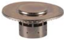
Vertical flue terminal