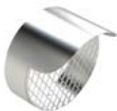
Stainless steel grid with rain cover