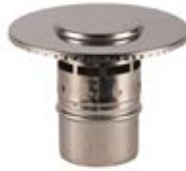
Vertical flue terminal