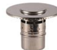
Vertical flue terminal