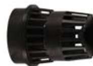
Horizontal flue terminal