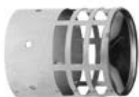
Horizontal flue terminal