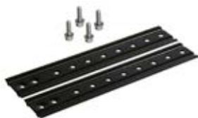
Extension for bracket